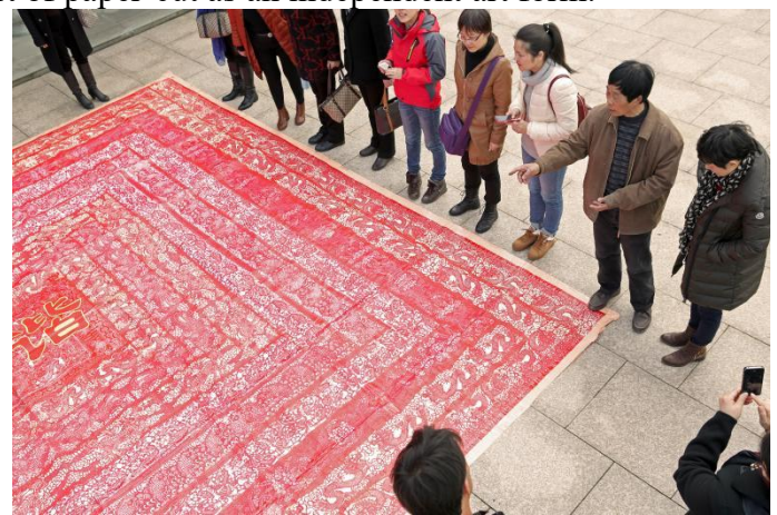
Fig. 3 Xie Caihua paper-cut work"Harmony", 47 square meters, 2000

The transformation of the function of folk paper-cut and the change of the aesthetic psychology of the creative subject directly cause the change of the art form of folk paper-cut [3]. With the increase in the number of competitions and exhibitions, to highlight the uniqueness of paper-cutting in Xiangshan, Xie has gradually broken through the tradition of small size in his works. On the important day of the return of Hong Kong and Macao, Xie Caihua created a 50-meter-long "Auspicious" and an equally long one, as a precious gift, the 100 "A hundred Xi", with different shapes of male and female dolls, was presented to the two special administrative regions. In 2000, his work harmony reached 47 square meters (Fig. 3), with 8-9 people standing on one side. With the establishment of new organizations and new exhibitions, it is difficult for the fragmented paper-cut works to capture the attention of the audience. At the same time, Xie's creative style is becoming more mature and distinctive, and his material accumulation is also increasingly rich, it is an inevitable trend in the development of paper-cut in Xiangshan and a reflection of the folk art of paper-cut as an independent art form.